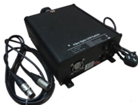
DMX 512 control LED light engine