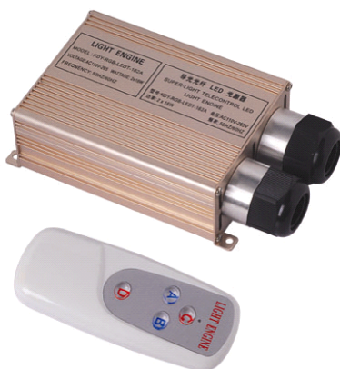
Double coupling heads LED Light Engine